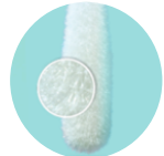
Hydraflock swab (80 mm Breakpoint)